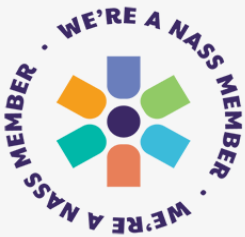
Shortlisted for the NASS Awards 2023 Outstanding Impact

Your opportunities for personal growth, training and professional development are encouraged via our CPD programme , but also by the holistic way we work, with our multi-disciplinary team such as therapists and mental health practitioners embedded within the school. Staff come from a range of backgrounds and disciplines, but all share a genuine desire to create a positive, supportive atmosphere , and to encourage improvement and growth in a professional, measurable way.