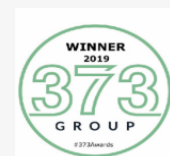
373 Group Business Awards Winners – unsung heroes.