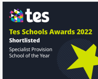
TES Awards 2022 Shortlisted for Specialist Provider of the year.